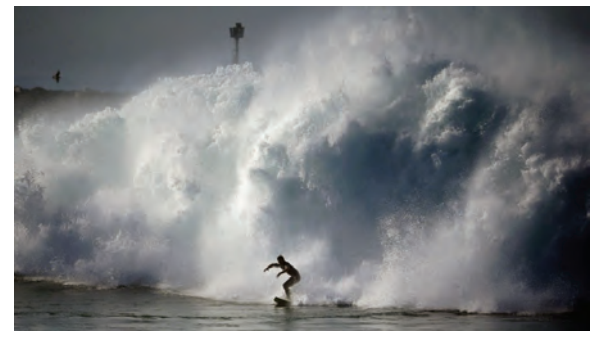
Photos of the Wedge, Newport