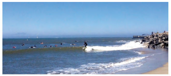
Once a decade surf at Inner Cabrillo Beach - Zack Millett